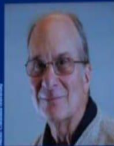
Louis Brus Columbia University USA