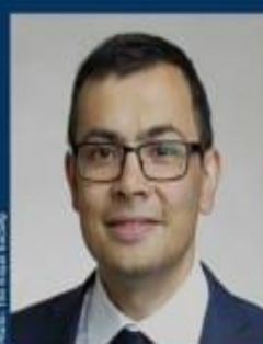
Demis Hassabis Google DeepMind United Kingdom

"för datorbaserad proteindesign" "for computational protein design"