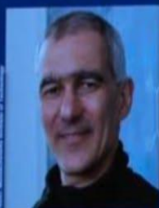
Moungi Bawendi Massachusetts Institute of Technology (MIT) USA