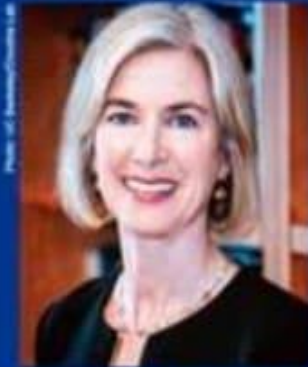
Jennifer A. Doudna

Läs mer om årets Nobelpris i kemi: www.kva.se Read more about this year's Nobel Prize in Chemistry: www.kva.se/en