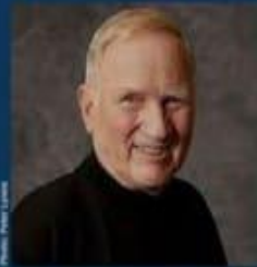
John F. Clauser

Université Paris-Saclay & École Polytechnique, France