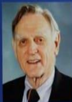
John B. Goodenough

KUNGL. VETENSKAPS- AKADEMIEN THE ROYAL SWEDISH ACADEMY OF SCIENCES