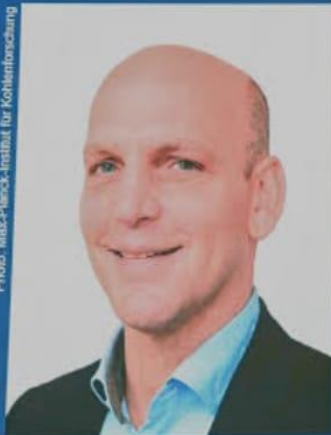
Benjamin List, Germany