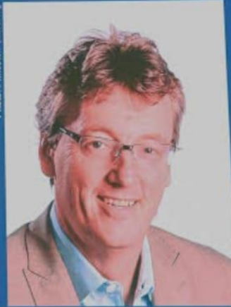
David MacMillan, USA

"för utveckling av asymmetrisk organokatalys"