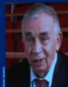
Alexei Ekimov Nanocrystals Technology Inc. USA

"för upptäckt och syntes av kvantprickar" "for the discovery and synthesis of quantum dots"