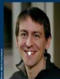
John M. Jumper Google DeepMind United Kingdom

"för proteinstrukturprediktion" "for protein structure prediction"